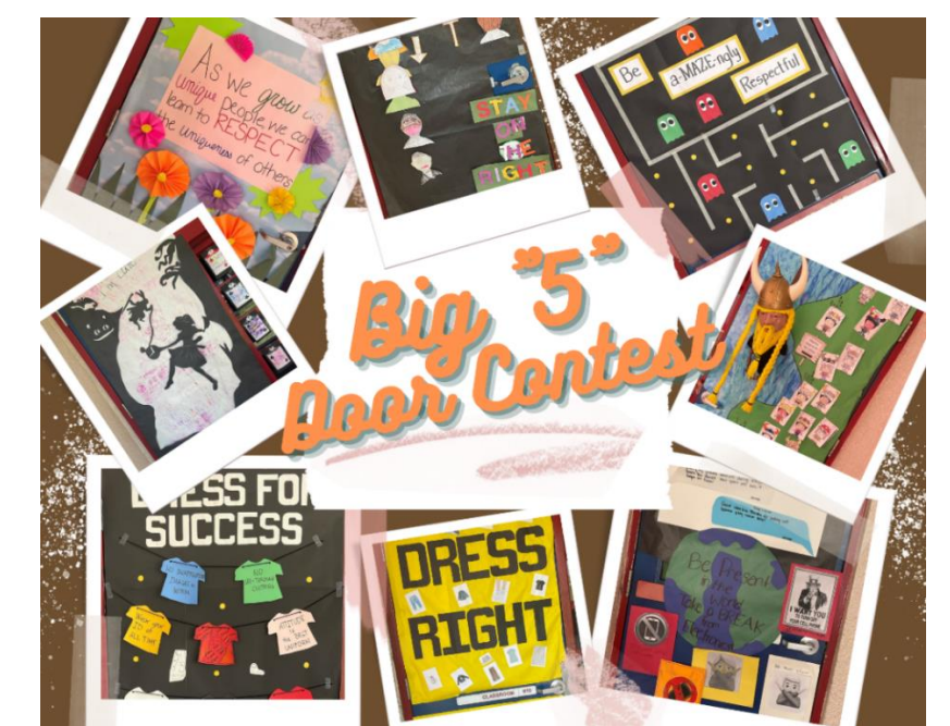
Big "5" Door Decorating Contest: Students participated in a door decorating contest to demonstrate their understanding of the Big "5" in their first period classes.

6)Completes Digital 50 daily7)Knows and is able to explain his/her data