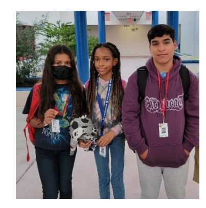
Awesome Olsen MS students proudly display their student ID badges for the 2022-23 school year!

Parents, please encourage your child to place ID badges in their bookbags or a safe location so that they are less apt to lose them and incur additional and disciplinary consequences.